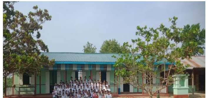
Renovated Kin Village School before and after the cyclone