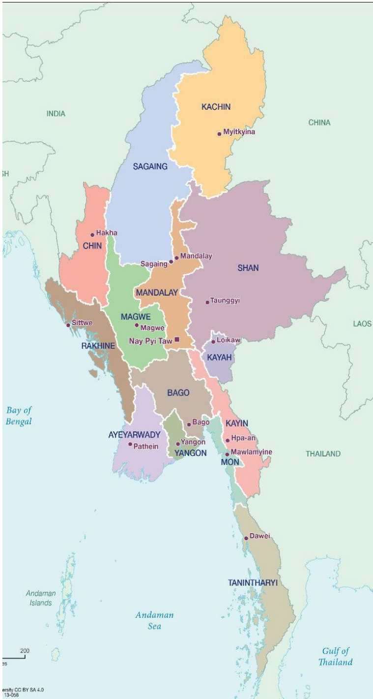
Map of Myanmar with States and Regions