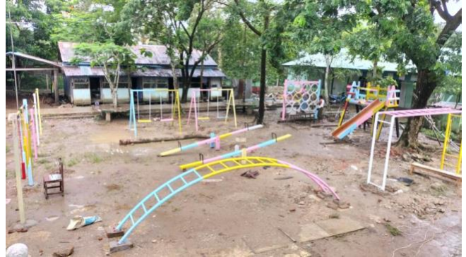
Ga Yan School playground, Ayeyarwady region