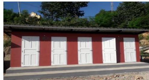
Sanitation Improvement - USD 4,000