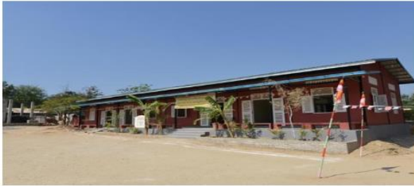
School Building – 100'x30' - USD 46,000