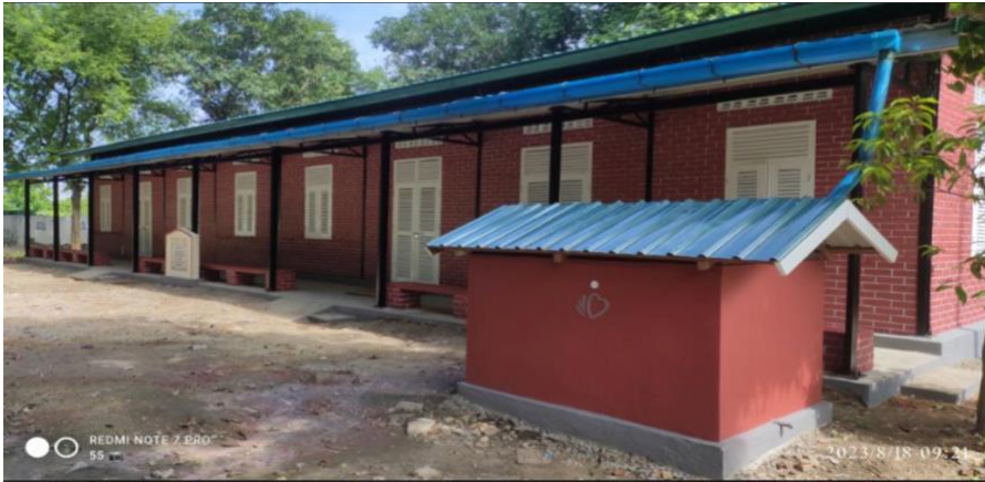
Sin YwaTaw Monastic School