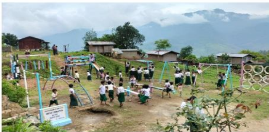
Playground - USD 3,500