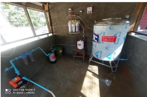
Drinking Water - USD 1,500