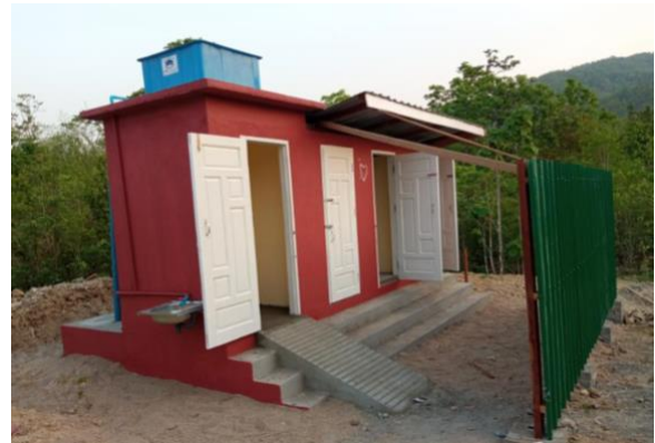
The new Gabani School building and toilet block