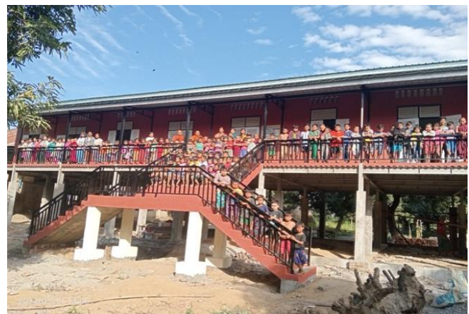
Old versus New – Win Chan Monastic School