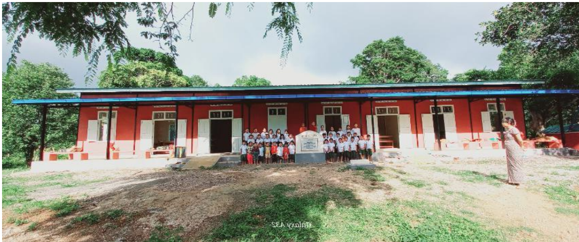
New Ho Namp School Building

The school was founded in 2009 by the community in order to provide local children with access to basic education. When the school first started there were no proper school buildings, only a temporary bamboo building. In 2019 the school received approval from the Ministry of Education to begin offering instruction for primary school students from Kindergarten (5+) to Grade 4 (9+).