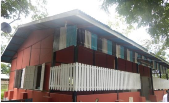
Renovated building at Aung Kabar School, Mandalay