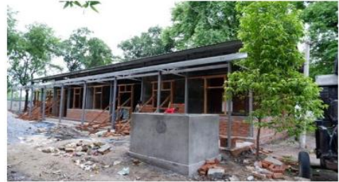
School Building – 80'x30' - USD 43,000